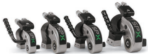
To be used with torque wrenches, pages 11-33